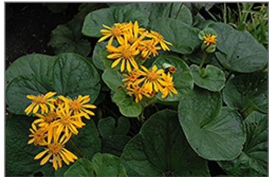
Desdemona Rayflower flowers

Desdemona Rayflower will grow to be about 24 inches tall at maturity extending to 3 feet tall with the flowers, with a spread of 24 inches. It grows at a medium rate, and under ideal conditions can be expected to live for approximately 20 years. As an herbaceous perennial, this plant will usually die back to the crown each winter, and will regrow from the base each spring. Be careful not to disturb the crown in late winter when it may not be readily seen!