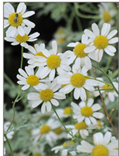
German Chamomile flowers