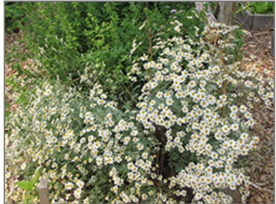
German Chamomile

German Chamomile will grow to be about 24 inches tall at maturity, with a spread of 18 inches. It grows at a fast rate, and under ideal conditions can be expected to live for approximately 5 years. As an herbaceous perennial, this plant will usually die back to the crown each winter, and will regrow from the base each spring. Be careful not to disturb the crown in late winter when it may not be readily seen!