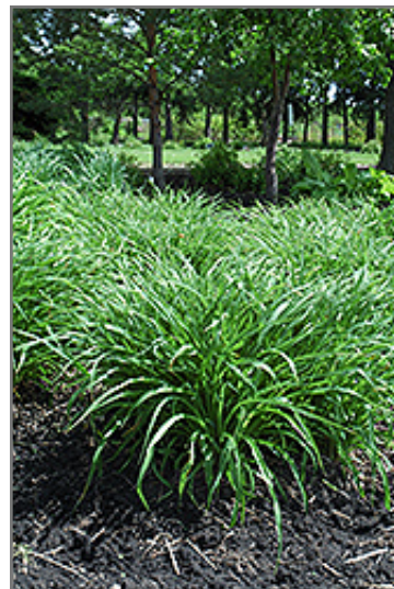
Moor Grass

Moor Grass will grow to be about 12 inches tall at maturity extending to 24 inches tall with the flowers, with a spread of 24 inches. Its foliage tends to remain dense right to the ground, not requiring facer plants in front. It grows at a slow rate, and under ideal conditions can be expected to live for approximately 15 years. As an herbaceous perennial, this plant will usually die back to the crown each winter, and will regrow from the base each spring. Be careful not to disturb the crown in late winter when it may not be readily seen!