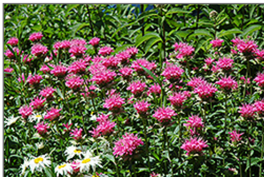
Marshall's Delight Beebalm flowers