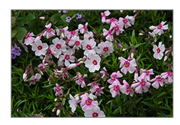
Laura Moss Phlox flowers