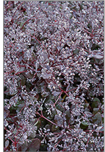
Bertram Anderson Stonecrop flowers

Bertram Anderson Stonecrop is recommended for the following landscape applications;