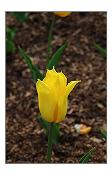
Yokohama Tulip flowers

Yokohama Tulip has masses of beautiful yellow cup-shaped flowers at the ends of the stems in mid spring, which are most effective when planted in groupings. The flowers are excellent for cutting. Its sword-like leaves remain green in color throughout the season.