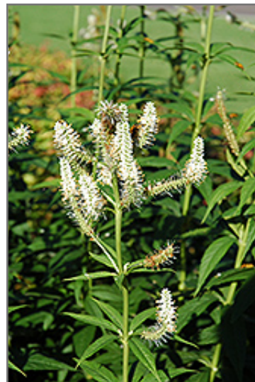
Culver's Root flowers