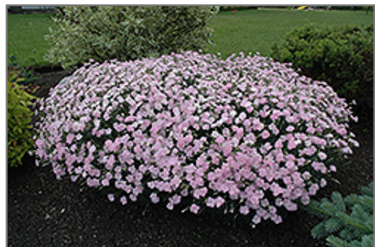
Mountain Mist Pinks in bloom