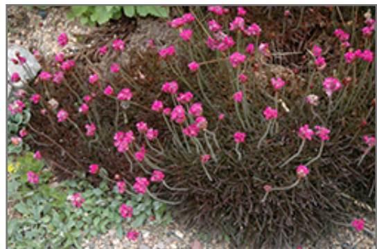
Red-leaved Sea Thrift in bloom