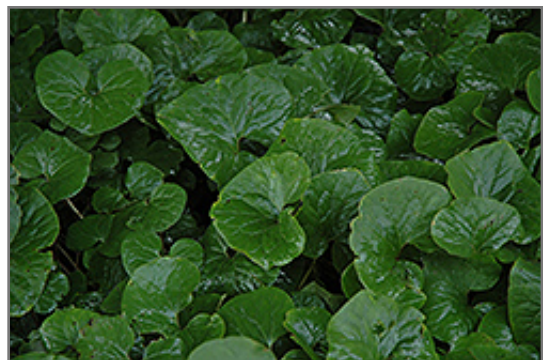
Canadian Wild Ginger