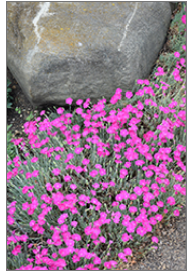
Firewitch Pinks in bloom

Firewitch Pinks is a fine choice for the garden, but it is also a good selection for planting in outdoor pots and containers. It is often used as a 'filler' in the 'spiller-thriller-filler' container combination, providing a mass of flowers and foliage against which the thriller plants stand out. Note that when growing plants in outdoor containers and baskets, they may require more frequent waterings than they would in the yard or garden.