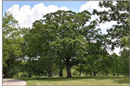
White Oak