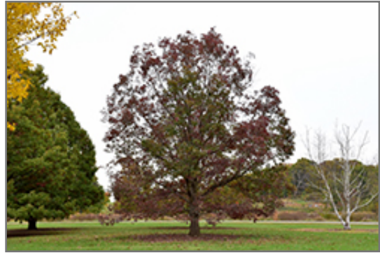
White Oak in fall

This tree should only be grown in full sunlight. It is very adaptable to both dry and moist locations, and should do just fine under average home landscape conditions. It is not particular as to soil type, but has a definite preference for acidic soils. It is highly tolerant of urban pollution and will even thrive in inner city environments. This species is native to parts of North America.