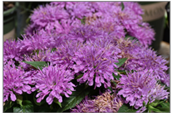
Grand Parade Beebalm flowers

Grand Parade Beebalm is recommended for the following landscape applications;