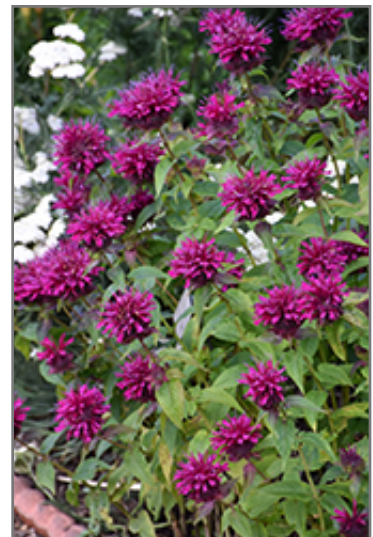
Grand Parade Beebalm flowers