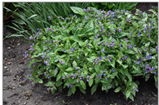
Dark Vader Lungwort in bloom