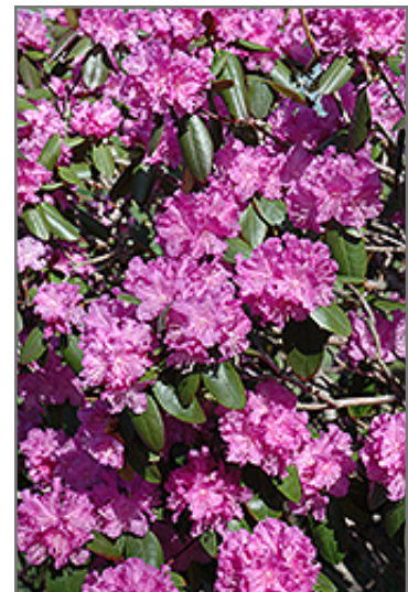
P.J.M. Rhododendron flowers