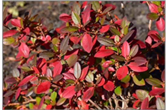
P.J.M. Rhododendron in fall

This shrub does best in full sun to partial shade. You may want to keep it away from hot, dry locations that receive direct afternoon sun or which get reflected sunlight, such as against the south side of a white wall. It requires an evenly moist well-drained soil for optimal growth, but will die in standing water. It is very fussy about its soil conditions and must have rich, acidic soils to ensure success, and is subject to chlorosis (yellowing) of the foliage in alkaline soils. It is somewhat tolerant of urban pollution, and will benefit from being planted in a relatively sheltered location. Consider applying a thick mulch around the root zone in winter to protect it in exposed locations or colder microclimates. This particular variety is an interspecific hybrid.