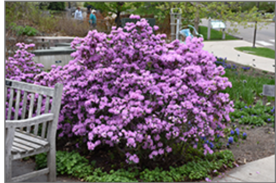
P.J.M. Rhododendron in bloom

P.J.M. Rhododendron is recommended for the following landscape applications;