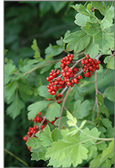
Fragrant Sumac fruit

Fragrant Sumac is recommended for the following landscape applications;