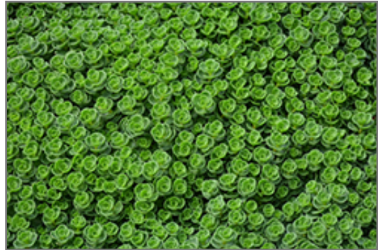
John Creech Stonecrop foliage

John Creech Stonecrop will grow to be only 3 inches tall at maturity, with a spread of 12 inches. When grown in masses or used as a bedding plant, individual plants should be spaced approximately 10 inches apart. Its foliage tends to remain low and dense right to the ground. It grows at a fast rate, and under ideal conditions can be expected to live for approximately 10 years. As an herbaceous perennial, this plant will usually die back to the crown each winter, and will regrow from the base each spring. Be careful not to disturb the crown in late winter when it may not be readily seen!