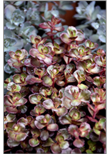
Voodoo Stonecrop foliage

Voodoo Stonecrop is recommended for the following landscape applications;