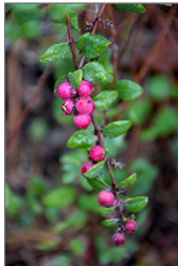
Hancock Coralberry fruit