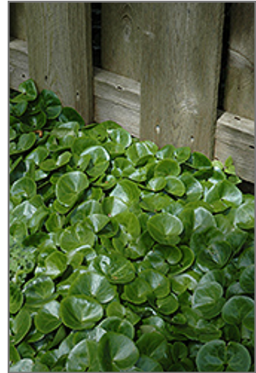
European Wild Ginger