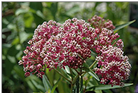
Cinderella Milkweed flowers

Cinderella Milkweed is recommended for the following landscape applications;