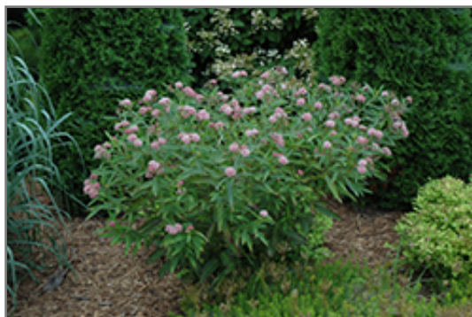
Cinderella Milkweed in bloom