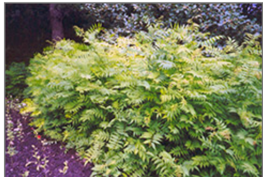
False Spirea