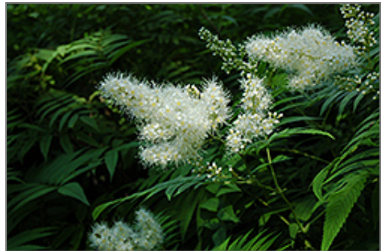
False Spirea flowers