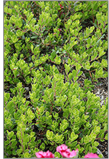
Bearberry foliage

This shrub does best in full sun to partial shade. It is very adaptable to both dry and moist growing conditions, but will not tolerate any standing water. It is considered to be drought-tolerant, and thus makes an ideal choice for a low-water garden or xeriscape application. It is very fussy about its soil conditions and must have sandy, acidic soils to ensure success, and is subject to chlorosis (yellowing) of the foliage in alkaline soils, and is able to handle environmental salt. It is somewhat tolerant of urban pollution. This species is native to parts of North America.