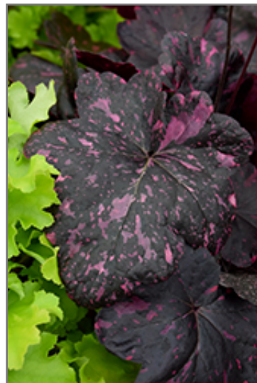
Midnight Rose Coral Bells foliage

Midnight Rose Coral Bells is recommended for the following landscape applications;