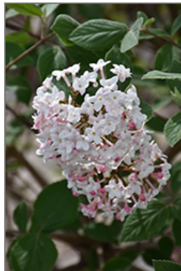
Judd's Viburnum flowers

This is a relatively low maintenance shrub, and should only be pruned after flowering to avoid removing any of the current season's flowers. It is a good choice for attracting birds to your yard, but is not particularly attractive to deer who tend to leave it alone in favor of tastier treats. It has no significant negative characteristics.