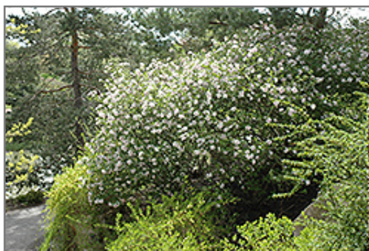
Judd's Viburnum in bloom