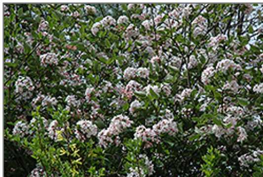
Judd's Viburnum flowers

This shrub does best in full sun to partial shade. It prefers to grow in average to moist conditions, and shouldn't be allowed to dry out. It is not particular as to soil type or pH. It is highly tolerant of urban pollution and will even thrive in inner city environments. This particular variety is an interspecific hybrid.