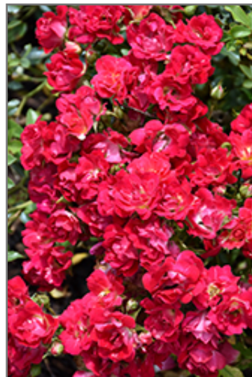
Red Drift Rose flowers

Red Drift Rose is recommended for the following landscape applications;