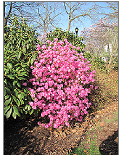
Landmark Rhododendron in bloom