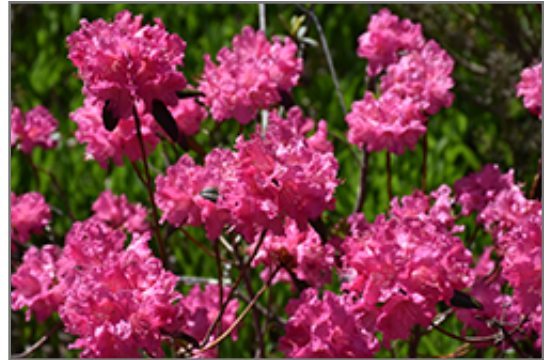
Landmark Rhododendron flowers