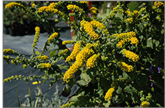
Golden Fleece Goldenrod flowers