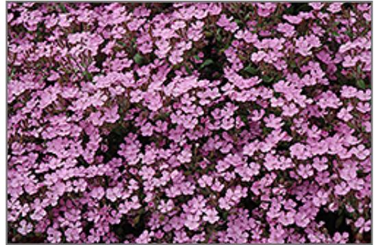
Home Fires Woodland Phlox flowers