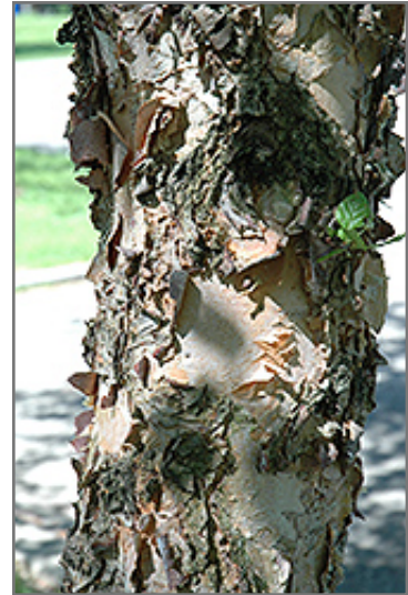
Heritage Improved River Birch bark

Heritage Improved River Birch will grow to be about 50 feet tall at maturity, with a spread of 35 feet. It has a low canopy with a typical clearance of 3 feet from the ground, and should not be planted underneath power lines. It grows at a fast rate, and under ideal conditions can be expected to live for 70 years or more.