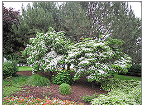
Chinese Dogwood in bloom