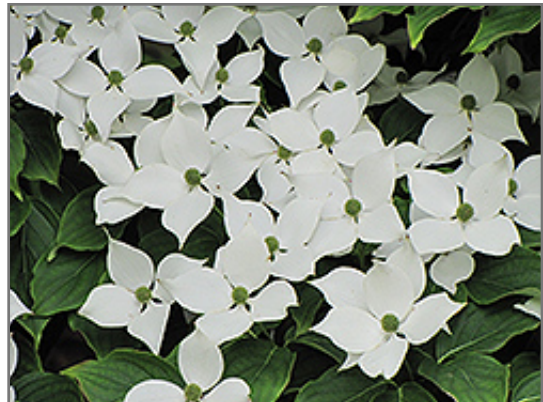
Chinese Dogwood flowers