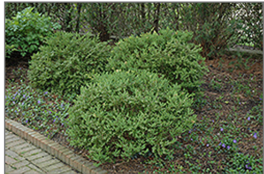
Wintergreen Boxwood