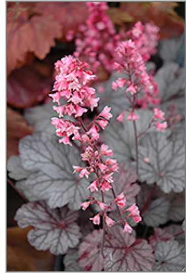
Milan Coral Bells flowers

Milan Coral Bells is recommended for the following landscape applications;