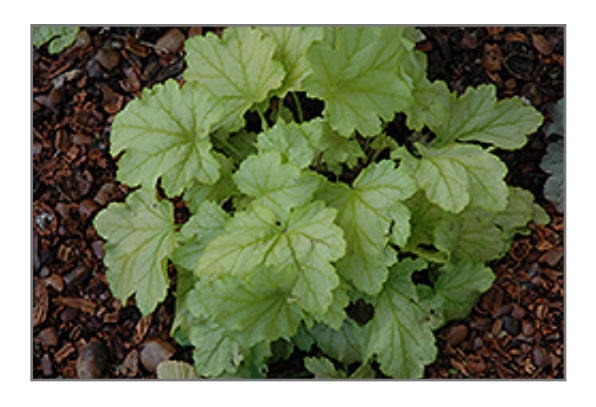
Mint Julep Coral Bells foliage