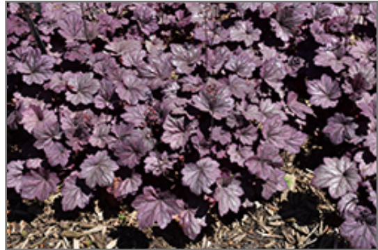
Sugar Plum Coral Bells

Sugar Plum Coral Bells will grow to be about 12 inches tall at maturity extending to 24 inches tall with the flowers, with a spread of 18 inches. When grown in masses or used as a bedding plant, individual plants should be spaced approximately 15 inches apart. Its foliage tends to remain dense right to the ground, not requiring facer plants in front. It grows at a medium rate, and under ideal conditions can be expected to live for approximately 10 years. As an evergreen perennial, this plant will typically keep its form and foliage year-round.