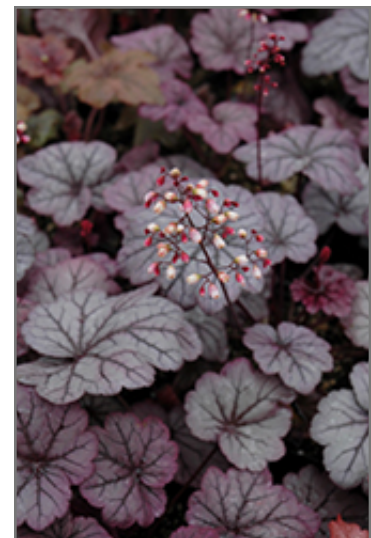
Sugar Plum Coral Bells flowers