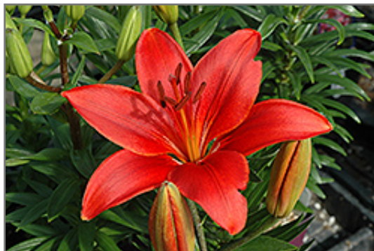
Crimson Pixie Lily flowers