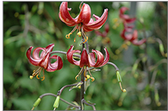
Claude Shride Martagon Lily flowers