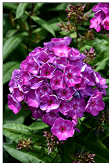
Grape Lollipop Garden Phlox flowers

Grape Lollipop Garden Phlox is recommended for the following landscape applications;