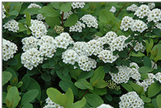
Birchleaf Spirea flowers