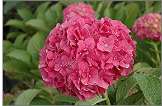
Glowing Embers Hydrangea flowers