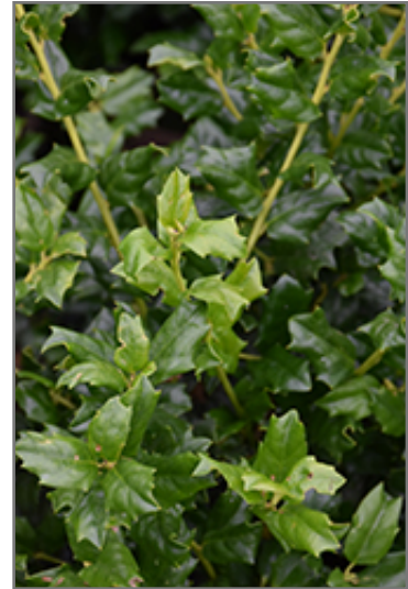
China Girl Meserve Holly foliage

China Girl Meserve Holly makes a fine choice for the outdoor landscape, but it is also well-suited for use in outdoor pots and containers. Because of its height, it is often used as a 'thriller' in the 'spiller-thriller-filler' container combination; plant it near the center of the pot, surrounded by smaller plants and those that spill over the edges. It is even sizeable enough that it can be grown alone in a suitable container. Note that when grown in a container, it may not perform exactly as indicated on the tag - this is to be expected. Also note that when growing plants in outdoor containers and baskets, they may require more frequent waterings than they would in the yard or garden.