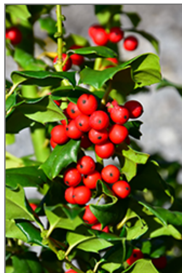
China Girl Meserve Holly fruit

China Girl Meserve Holly is recommended for the following landscape applications;