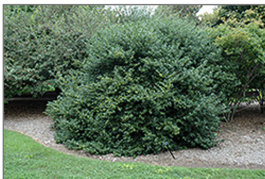
China Girl Meserve Holly