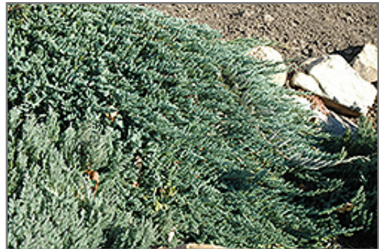
Blue Prince Juniper