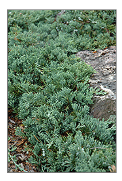
Blue Rug Juniper foliage