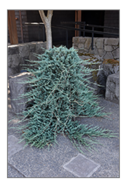
Blue Rug Juniper

Blue Rug Juniper is recommended for the following landscape applications;