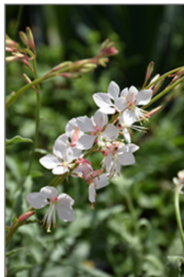
Whirling Butterflies Gaura flowers

Whirling Butterflies Gaura is an open herbaceous perennial with tall flower stalks held atop a low mound of foliage. It brings an extremely fine and delicate texture to the garden composition and should be used to full effect.