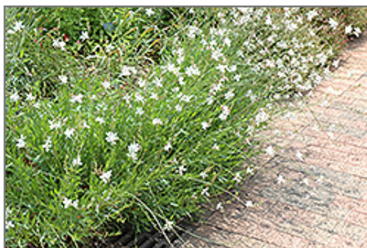
Whirling Butterflies Gaura in bloom