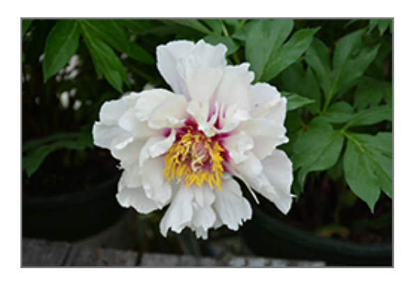
Cora Louise Peony flowers