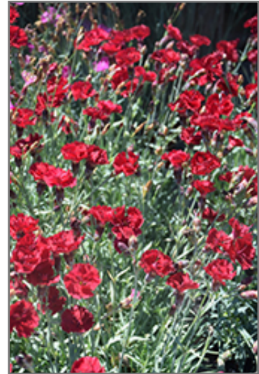
Fire Star Pinks flowers

Fire Star Pinks is a fine choice for the garden, but it is also a good selection for planting in outdoor pots and containers. It is often used as a 'filler' in the 'spiller-thriller-filler' container combination, providing a mass of flowers and foliage against which the thriller plants stand out. Note that when growing plants in outdoor containers and baskets, they may require more frequent waterings than they would in the yard or garden.