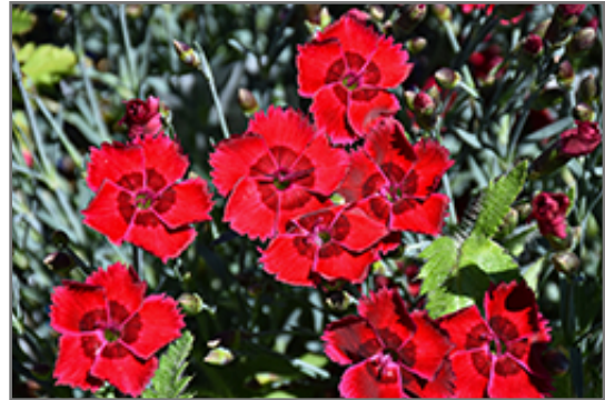
Fire Star Pinks flowers

Fire Star Pinks is an herbaceous evergreen perennial with a mounded form. It brings an extremely fine and delicate texture to the garden composition and should be used to full effect.