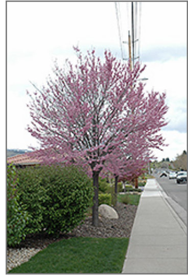
Eastern Redbud (tree form) in bloom

This tree does best in full sun to partial shade. It prefers to grow in average to moist conditions, and shouldn't be allowed to dry out. It is not particular as to soil type or pH. It is highly tolerant of urban pollution and will even thrive in inner city environments, and will benefit from being planted in a relatively sheltered location. Consider applying a thick mulch around the root zone in winter to protect it in exposed locations or colder microclimates. This is a selection of a native North American species.