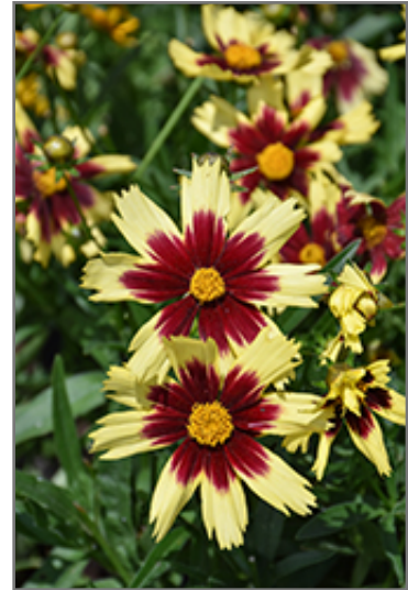
Cosmic Eye Tickseed flowers

Cosmic Eye Tickseed is recommended for the following landscape applications;