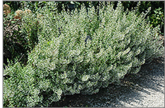
Montrose White Dwarf Calamint in bloom

Montrose White Dwarf Calamint is recommended for the following landscape applications;